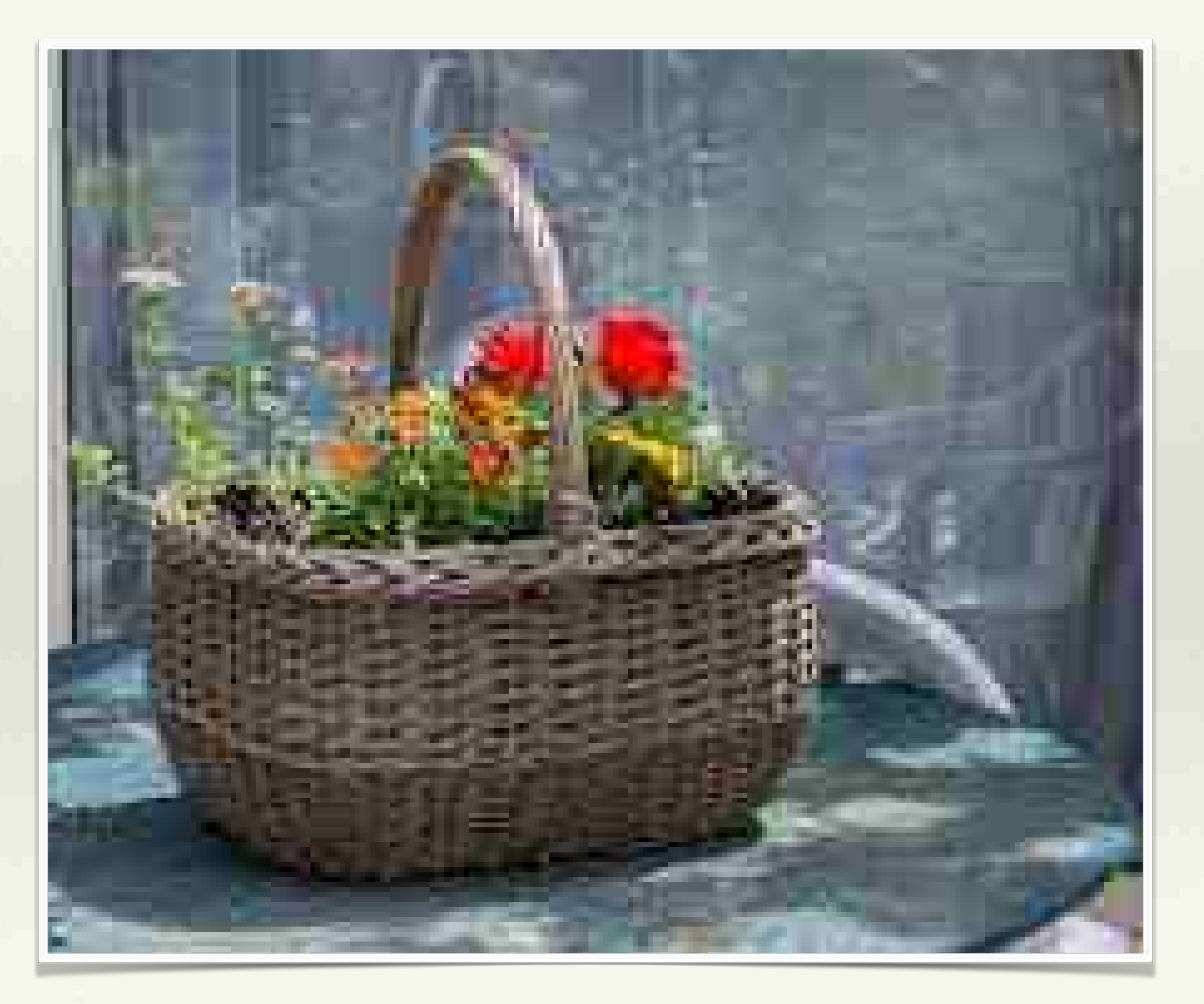
Wish the basket would only be full of flowers!

* C. Vacher « The family problems basket : meeting with families around a floating object in a medical service for teenagers » in Thérapie Familiale 2012